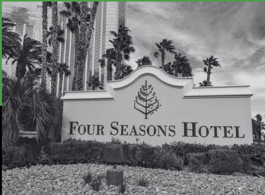
FOUR SEASONS HOTEL LAS VEGAS