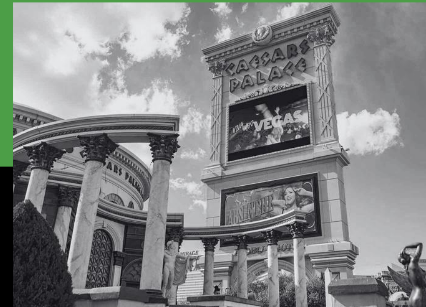
CAESARS PALACE LAS VEGAS